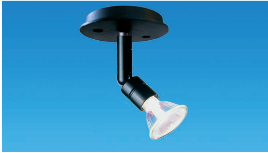
Leo Ceiling Plate