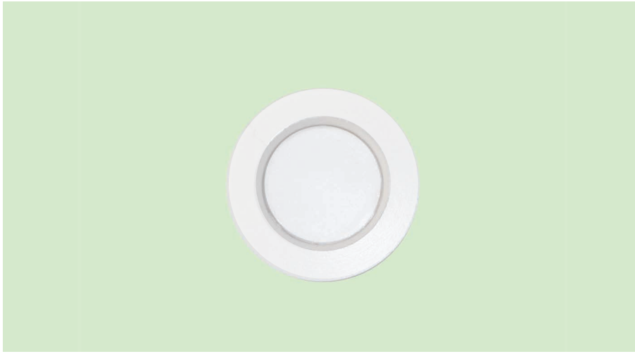
Kati LED 25 Insert 350mA 1.4w LED

Suitable for recessing into panels and steps for highlighting discrete areas.