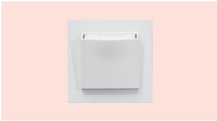
Energy saving Main switch - Key Card Holder

Energy Saving Main Switch is especially designed for use in Hotelrooms, Houses and Institutions.