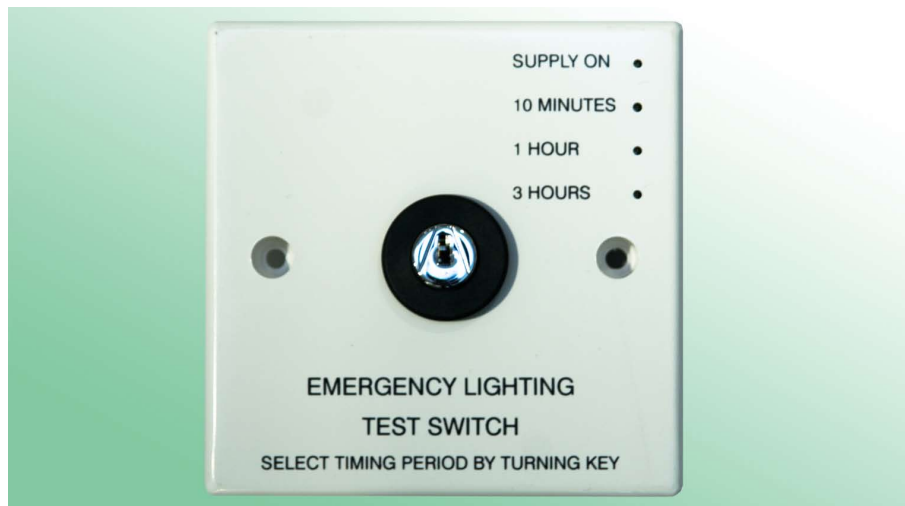
Emergency Test Switch