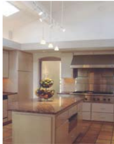
Cono Pendant 12V 20 - 50W MR16/ Capsule

Classic conical pendant with cast metal top ring and opal glass diffuser.