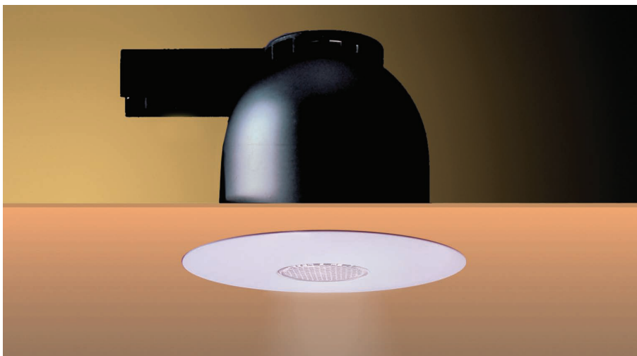
Orli 1 - Pin 12v 20 - 50w MR16

A downlight with a pin hole aperture and a clear front glass sealed to IP44 making it suitable for humid environments such as exterior soffits, showers and bathrooms.