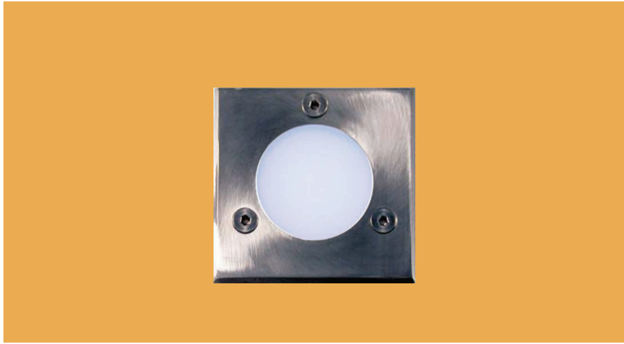
Square In Ground Exterior LED IP65